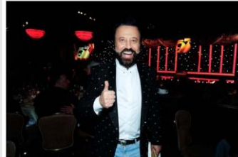
Actor and Comedian Yakov Smirnoff