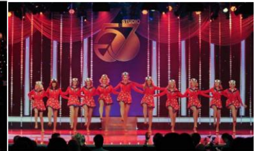
"SHARE ladies perform "In The Navy" rather than "Rick Dees performs Disco Duck."

Los Angeles – SHARE, INC., the 63 year-old philanthropic organization dedicated to raising funds for developmentally disabled, abused and neglected children as well as medical research, hosted its annual Boomtown gala, “An Evening at Studio 53,” tonight, Saturday, May 21, 2016 at The Beverly Hilton Hotel, Beverly Hills.